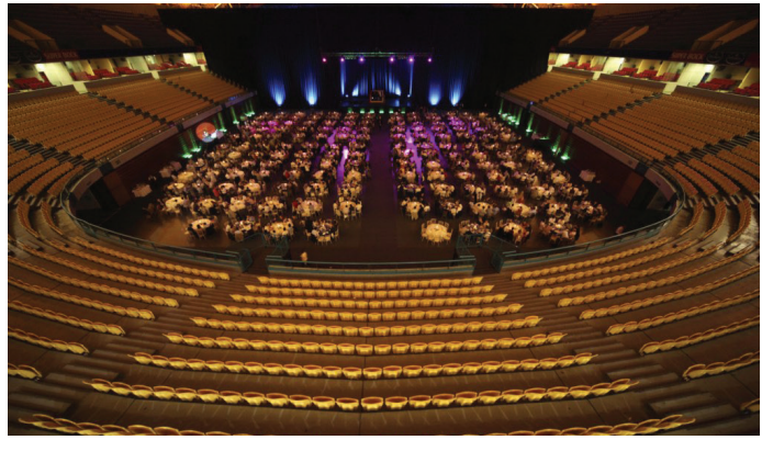
Congress Centre Rental