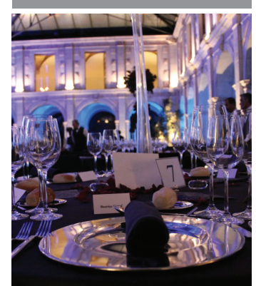
Attention to Detail