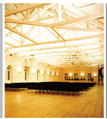
Pre & Post Congress Tours